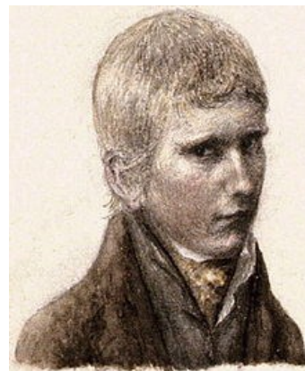
On the right, is a self-portrait of James Longacre at age 12.